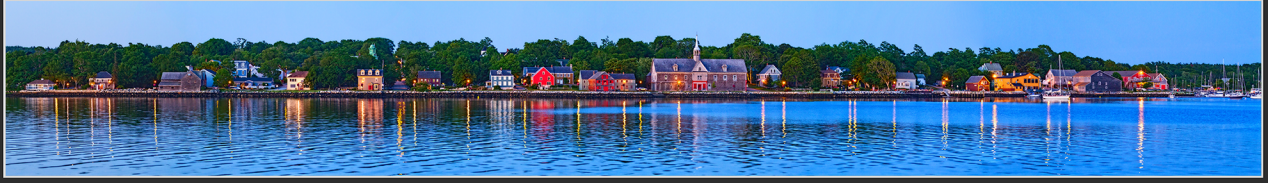
Lights Across the Harbour Historic Waterfront, Shelburne, Nova Scotia